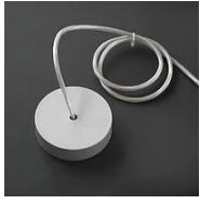
30721 Canopy Shanghai