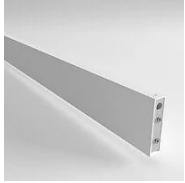
40157 Joint Eye