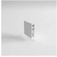
40155 Joint Eye