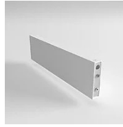
40156 Joint Eye